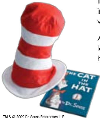
TM & © 2009 Dr. Seuss Enterprises, L.P. All Rights Reserved.

You will have everything you'll need to celebrate the 13th anniversary of Read Across America Day on March 2nd , when more than 45 million people will be in the company of a good book.