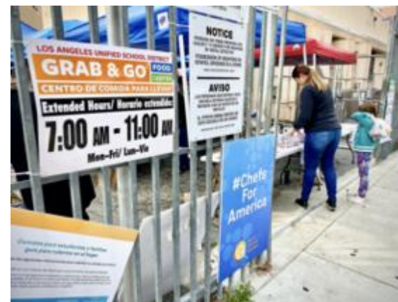
Accessible hours and information