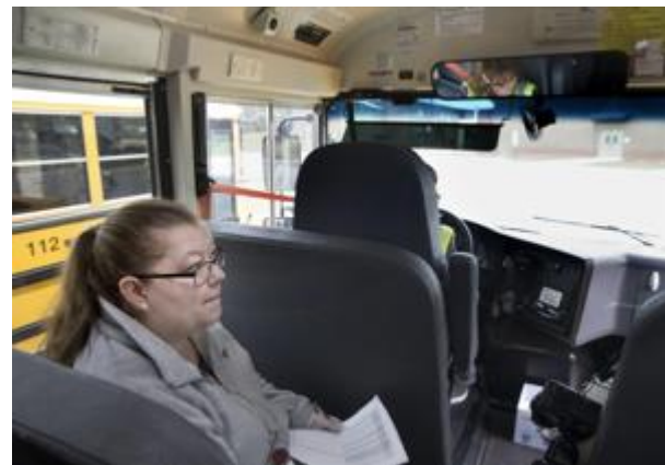
Counselors and nurses on delivery buses