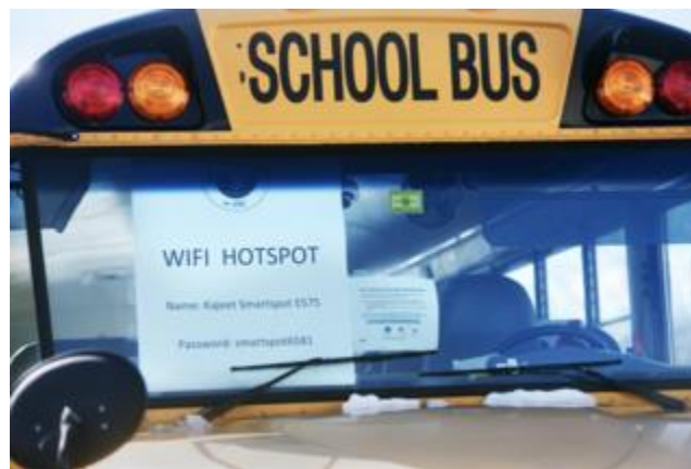
Fitting delivery buses with WiFi