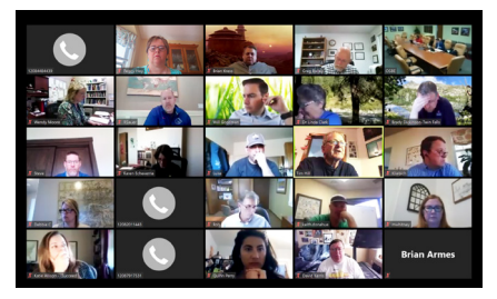
COVID-19 Crisis Committee for Education Meeting on Zoom

As we tackle these challenges educators are being acknowledged for having unique and first hand-knowledge of