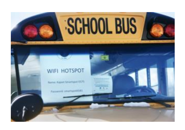
Fitting delivery busses with WiFi