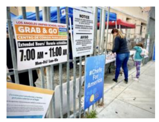
Accessible hours and information