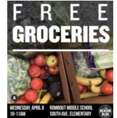
Free groceries at meal sites