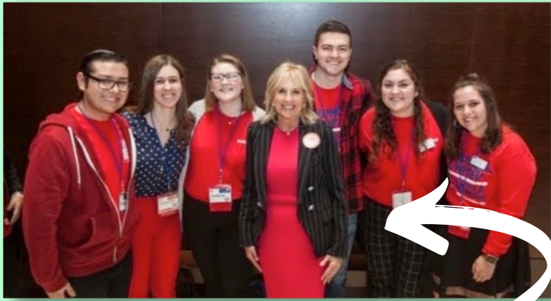
CATCH ME WITH FIRST LADY DR. JILL BIDEN!