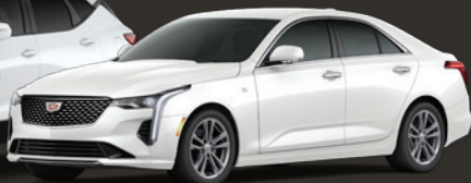
2023 Cadillac XT4

*At participating dealers. Not available with some other offers. Must take new retail delivery by 1/2/24. Excludes select trims; 2024 and 2023 Cadillac LYRIQ; 2023 and 2022 Cadillac CT4-V Blackwing 1SP; 2023 and 2022 Cadillac CT5-V Blackwing 1SV; 2023 and 2022 Cadillac Escalade; 2023 and 2022 Chevrolet Corvette; and all Buick and GMC models.