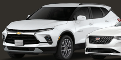
2023 Chevrolet Blazer

Start saving at gmeducatorappreciation.com