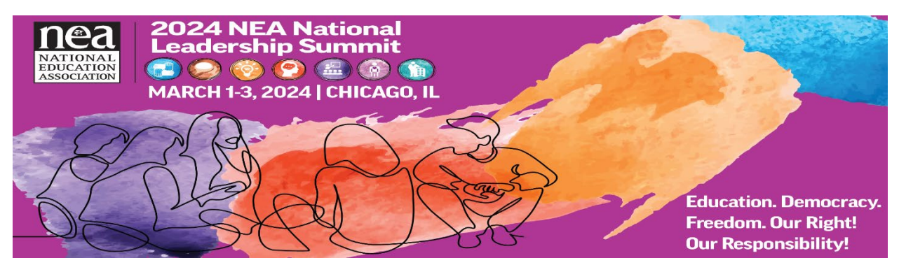
Saturday, March 2, 2024 • Content Session Block 2 • 1:00 to 3:00 PM CT