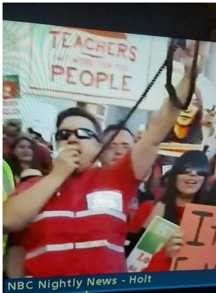
NBC Nightly News - Holt